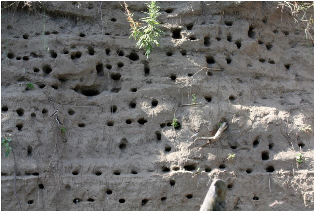
Figure 1. BANS colony illustrating the variation in burrow shape.

A “typical” BANS burrow entrance is wider than tall, roughly 3 inches wide by 2 inches tall, but there is great variation in this. Figure 1 is a representative photo of a BANS colony.